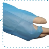
Thumb Hole Sleeves