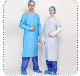
Blue and White