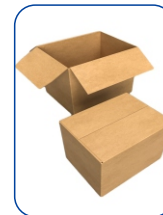
15 pcs/Medium sized bag 75 pcs/carton Carton Size:49*18.5*26cm