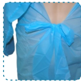
Tie on the waist